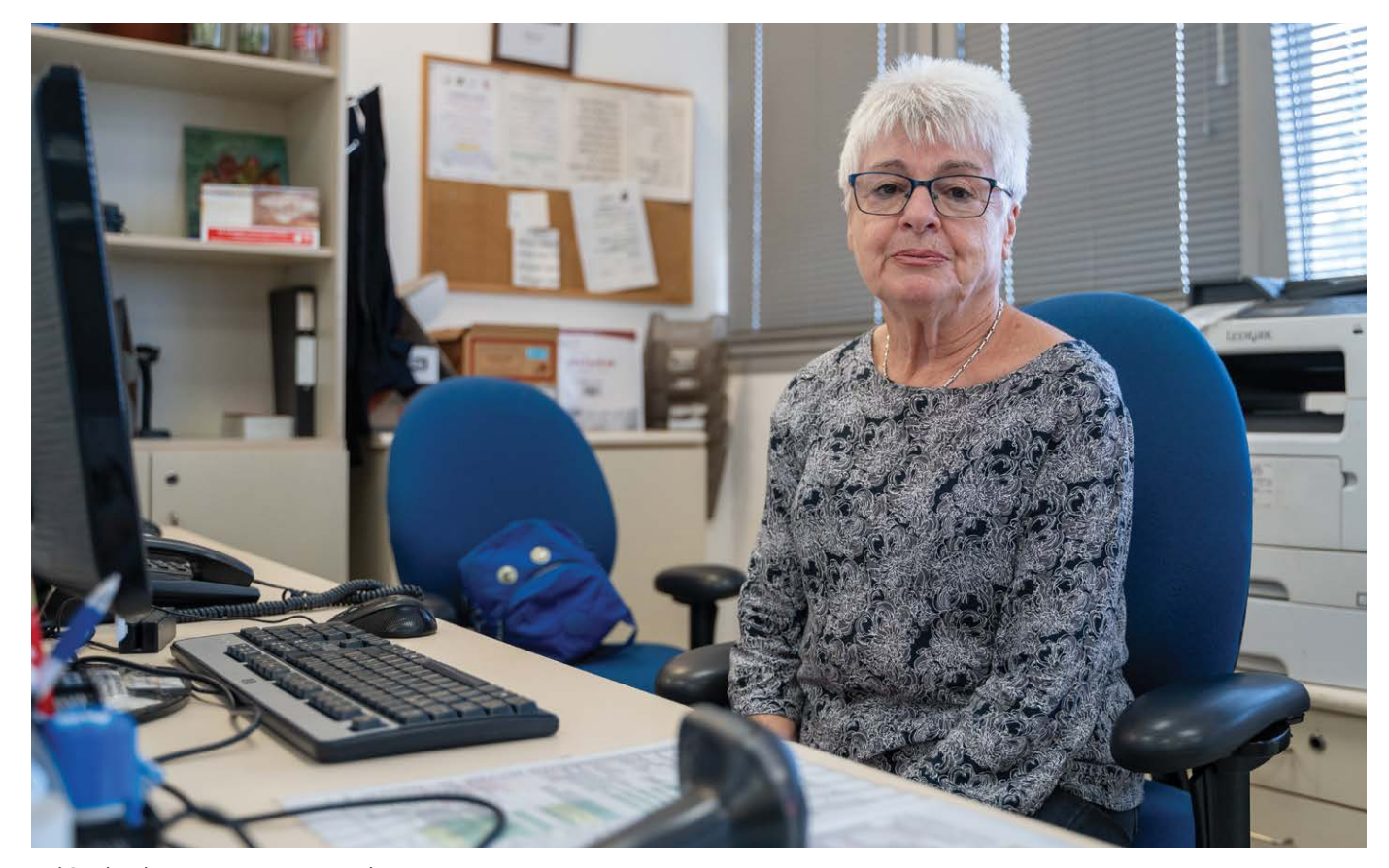
Yad Sarah volunteer waiting to greet clients.

attention, this man likely would have died.