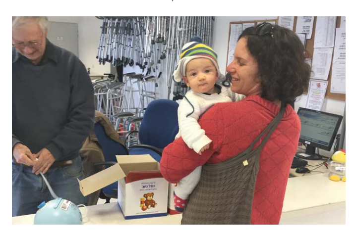
Woman picking up breast pump.

At Yad Sarah's Beersheva branch, you get a little taste of everything. With the wide range of services — from homebound outreach to legal services and rental equipment to life stories — there is something for everyone. We hope you enjoyed your time at the branch – come visit us in person for a live tour!