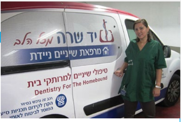
A Yad Sarah Mobile Dental Clinic van.

For many of us, the pain of a toothache is a mere inconvenience. After all, relief is just a visit to the dentist away. But imagine an individual who is homebound, confined to their bed due to health difficulties — and suddenly, the picture gets much more complicated. Thousands of people a year