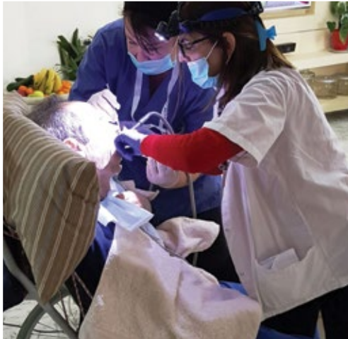
A Yad Sarah dentist at work.