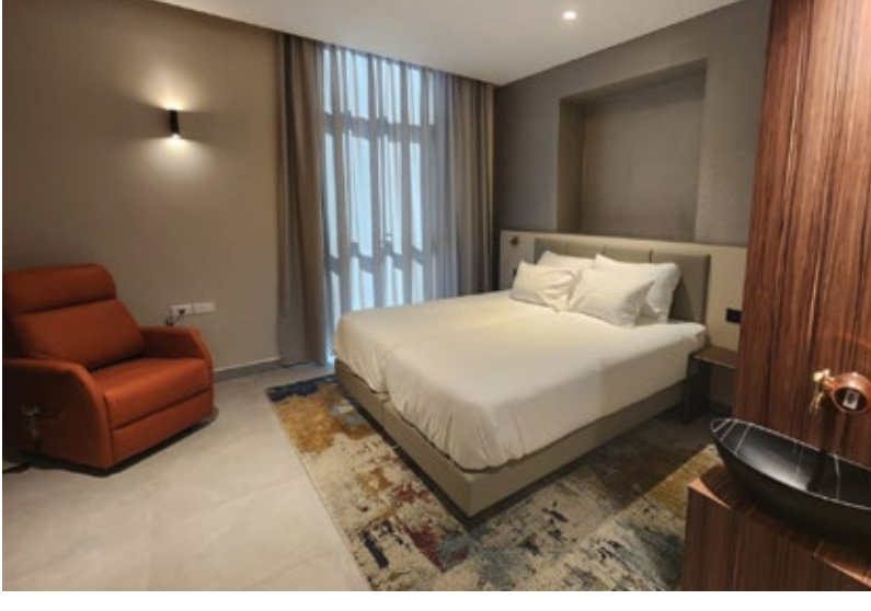
One of the Center's rooms.

recovery, to spare women the rough immediate integration back into home life after a stillbirth.