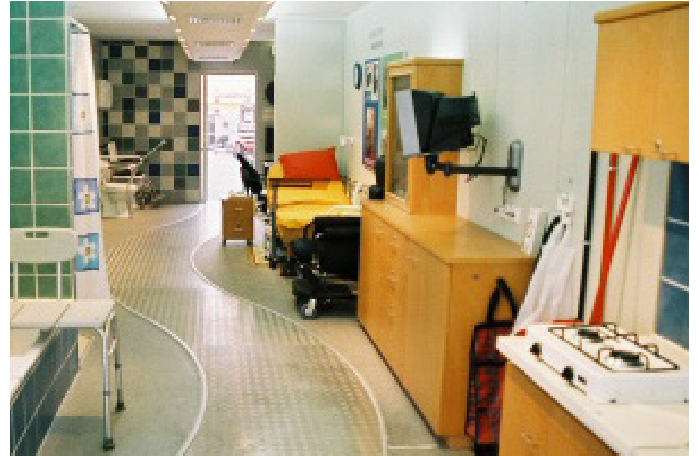
At Yad Sarah's Exhibition Center, we show people how to make changes at home to accommodate disabilities or injury