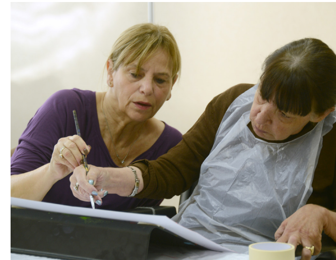
A women attending Yad Sarah rehab sessions