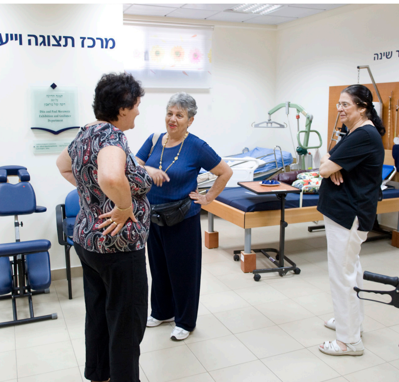
Working together at the Exhibition Center

Another example: last week a friend of one our volunteers came to see me. Her father is 95 years old and was hospitalized for a serious spinal injury. He needed to be in bed for a month, but the hospital was planning to discharge him the next day. The family did not even have a bed for him at home yet. This kind of thing happens all the time. Families come to us in a panic. They need our help. I helped her pick the right hospital bed for her father and sent her home with a portable overbed tilting table that would allow him to use the computer in bed. I knew that the man spoke a few languages, so I recommended she pick up some books on tape in different languages from the National Library to keep his mind active while recovering. This is the kind of help I offer to people calling or visiting our center for help.