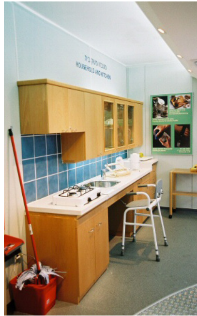
One of Yad Sarah's special chairs that allows you to work comfortably in the kitchen on display at the Exhibition Center