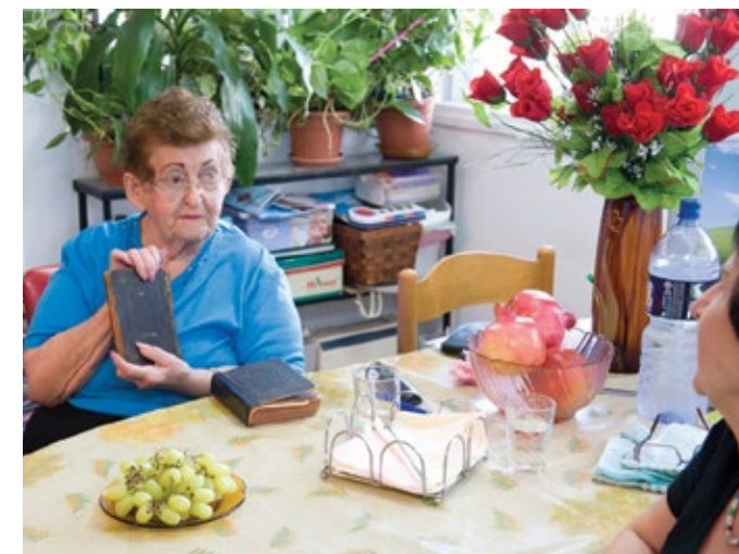
Yad Sarah volunteers often discuss books and movies with clients who are not able to leave their homes.

retirement, one of her colleagues recommended that she start volunteering for Yad Sarah. Her son signed her up to do home visits nearly 10 years ago.