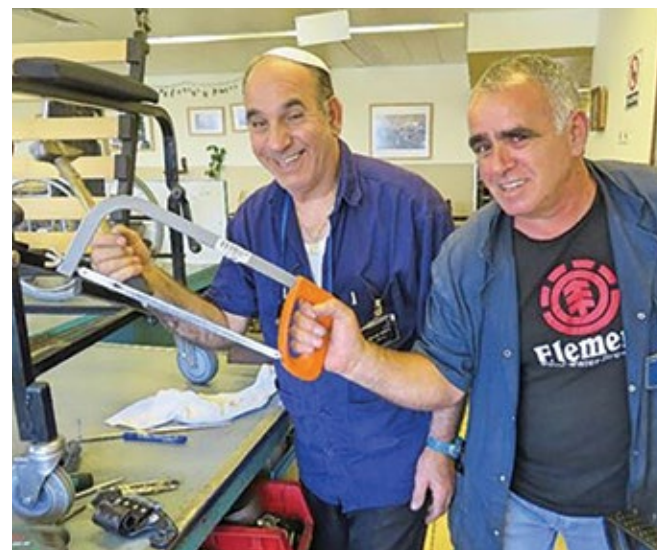
Volunteers use all sorts of tools to make equipment repairs in Modi'in.

About these solutions, Shimon says, "When your head is open and there is a good will, the sky is the limit!"