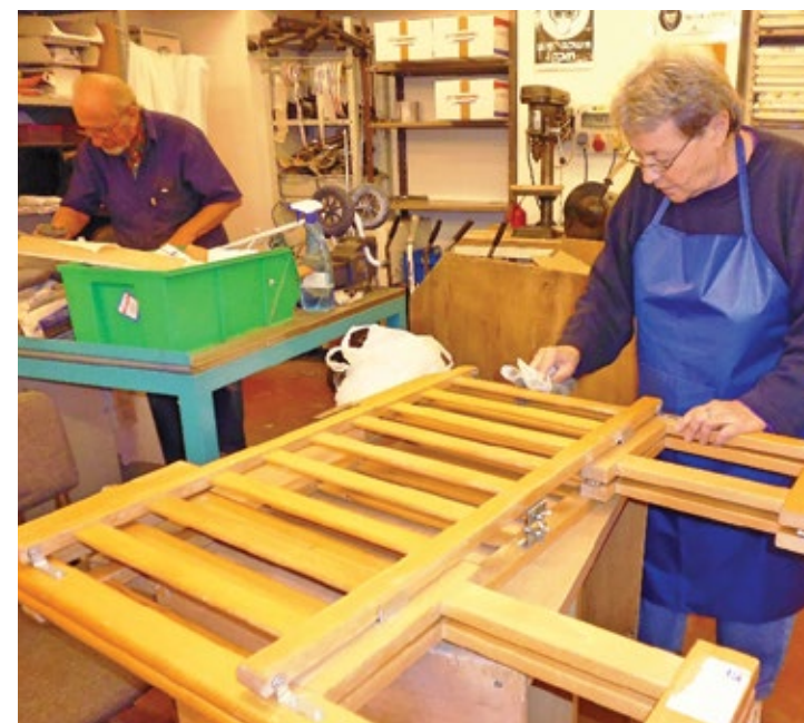
A volunteer puts the finishing touches on a crib he built, staining the beautiful wood.