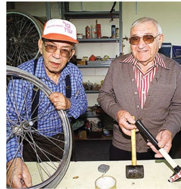
Sometimes, repairs include replacing the rubber and spokes of a wheel.

But most of all, the close connection between Yad Sarah's clients and its volunteers drives home just how much the organization functions as a family.