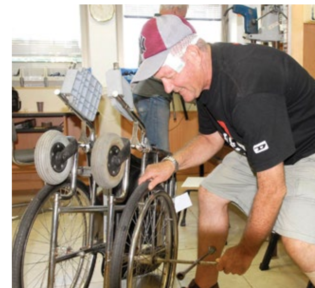
Some wheelchair repairs are simple – like tightening the bolts that keep wheels aligned.

"It brings me joy to finish a wheelchair, spin the