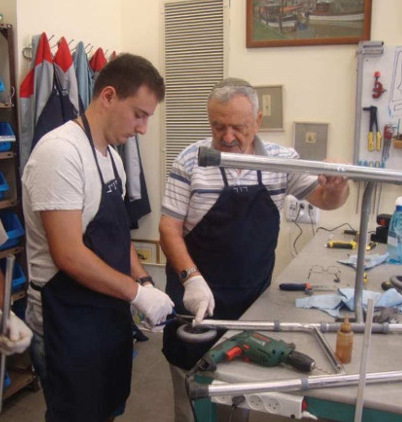
Yad Sarah volunteers have the know-how and equipment to fully rebuild walkers, saving money and resources.