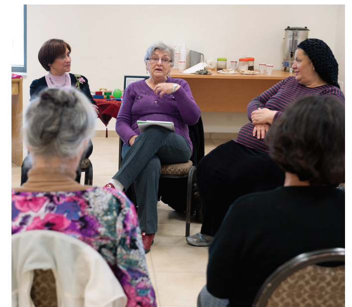
A group leader shares tips