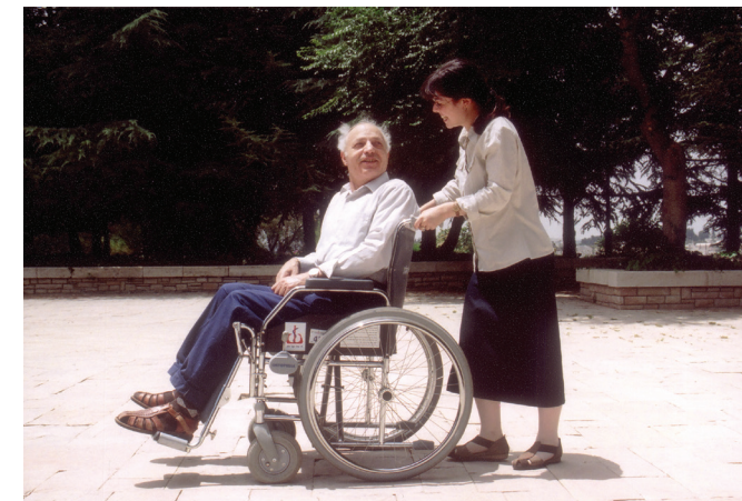
Helping a builder of Israel

As we mark Israel's 70th birthday, I am grateful for your commitment to this mission. With your generosity, we will continue to support the people who have built this vibrant, beautiful country, by bringing help and hope to all her citizens.