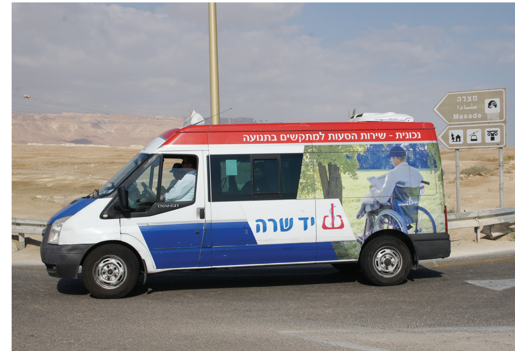
A Yad Sarah accessible van on the road to Masada.

Other outings have brought Israelis with disabilities to Jaffa, Jerusalem, the zoo, and battle sites of the 1948 War of Independence. Each trip carefully accounts for the special needs of its members—including their routines, times to rest and eat, a slower pace, and other factors. For each adventure, guides pick up each person and a companion from their homes with the Yad Sarah vans and returns them home after the conclusion of the trip.