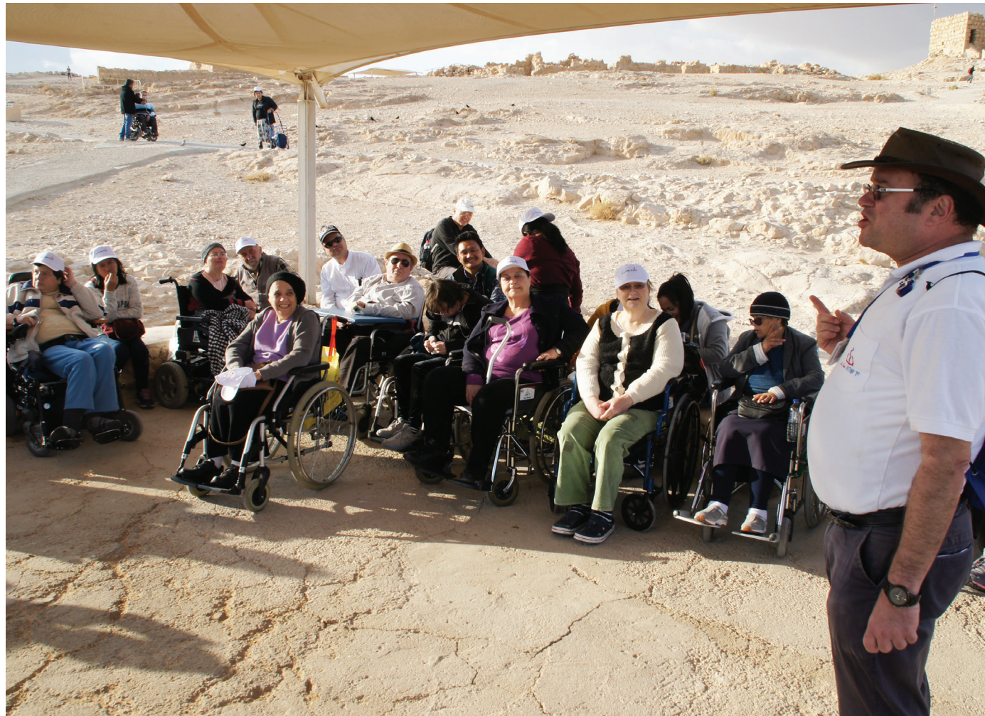
Learning about history on site.