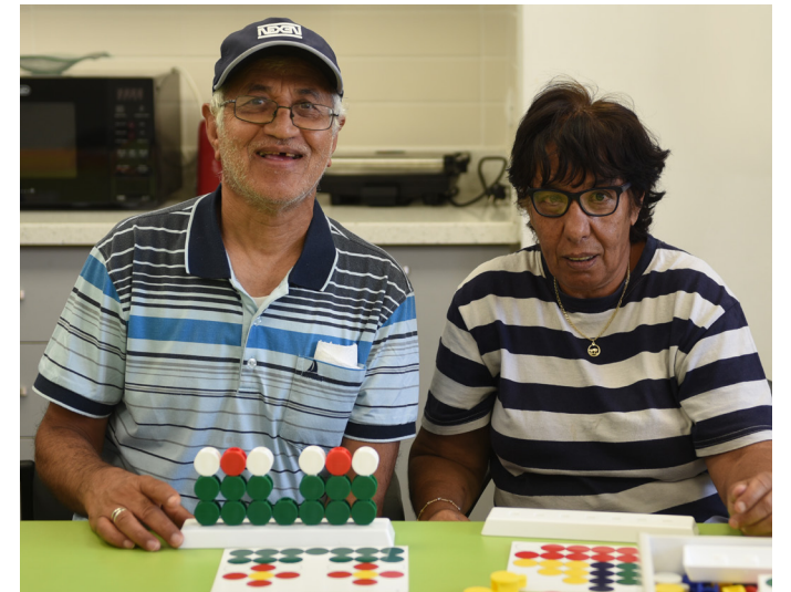
Clients enjoying games at Day Rehab